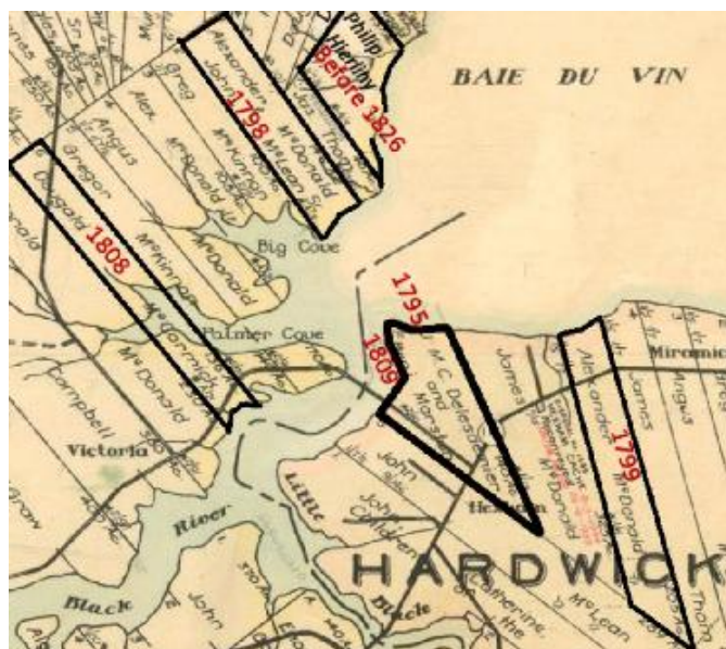
The Black River Properties