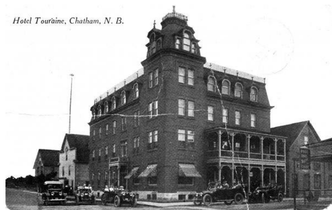
Hotel Touraine, Chatham, N. B.

Touraine Hotel, Chatham, NB was opened in 1908. It was destroyed by fire just after World War 11. The hotel was on a branch line of Canadian National Railway which brought tourists from Quebec.